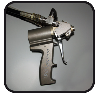
Wintermann XP3 spray Gun

We can design and manufacture equipment for special use or operating according to customer's design. We provide the opportunity to lease or buy equipment on credit as we cooperate with many renowned leasing companies.