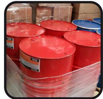
Components for spraying