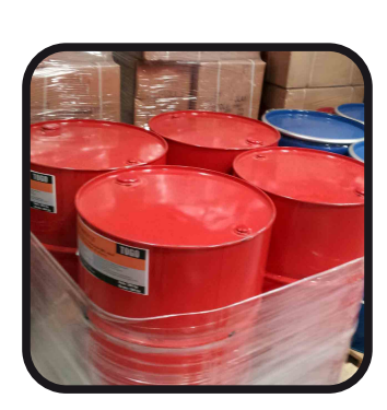
Components for spraying

** This folder is not an offer within the meaning of the law