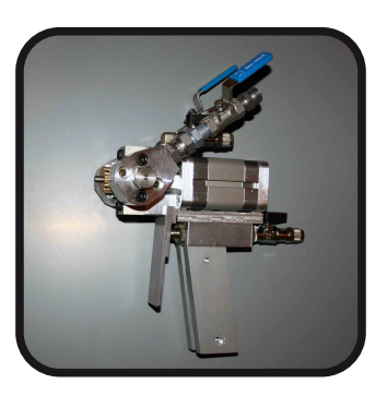
Graveco Raptor II Gun